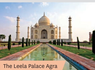
The Leela Palace Agra