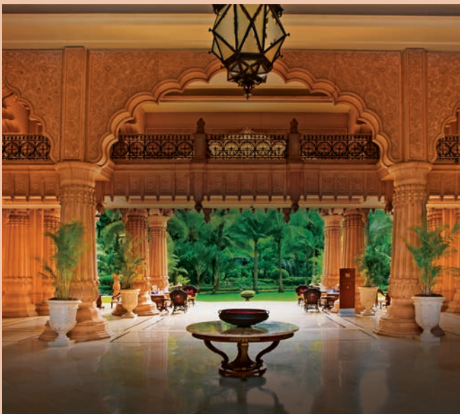
Porte Cochere at The Leela Palace Bengaluru

We are honoured to say that, in the same survey, The Leela Palace New Delhi was rated No. 31 among the Top 100 Hotels in the World. The hotel was also ranked No. 3 among the Top 10 City Hotels in Asia, a list in which The Leela Palace Bengaluru was ranked No. 10.