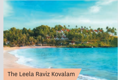
The Leela Raviz Kovalam