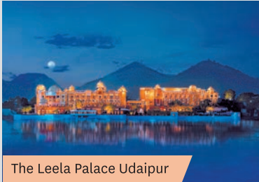
The Leela Palace Udaipur