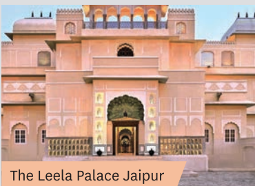
The Leela Palace Jaipur