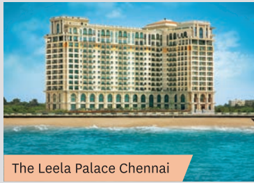
The Leela Palace Chennai