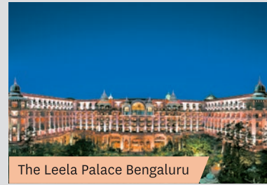
The Leela Palace Bengaluru