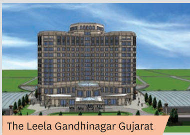
The Leela Gandhinagar Gujarat