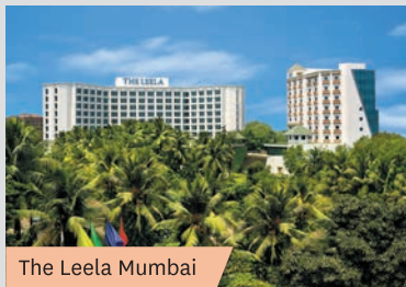
The Leela Mumbai