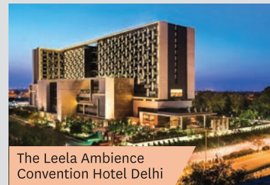
The Leela Ambience Convention Hotel Delhi