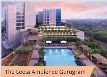
The Leela Ambience Gurugram