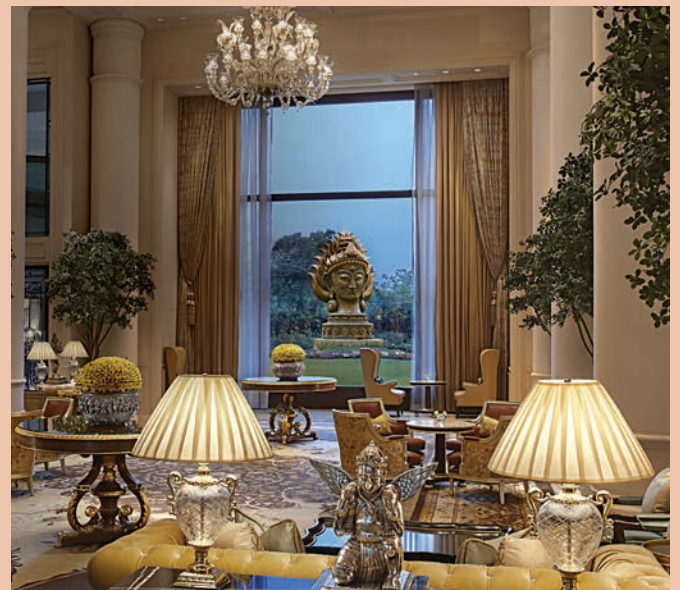
Lobby Lounge at The Leela Palace New Delhi