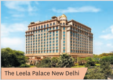
The Leela Palace New Delhi