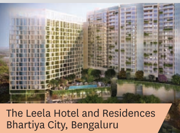
The Leela Hotel and Residences Bhartiya City, Bengaluru