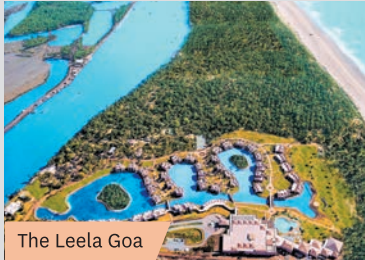
The Leela Goa